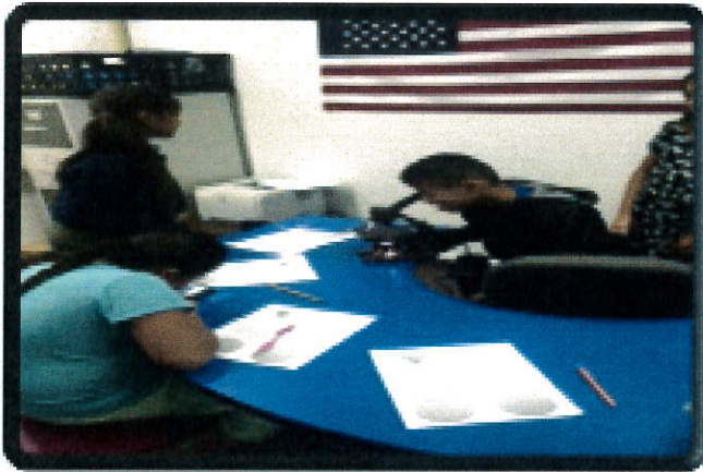
4 th Grade Science class learning how to safely use some Science tools.